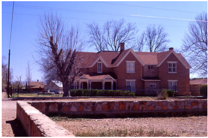
(Continued on next page)

Adventure fills the next few days. We spend several days in the region to see surrounding sites. A highlight is the world heritage site of the Paquimé ruins, the major trading point between high culture of central Mexico and the ancestral Puebloans of the American Southwest. This partially-reconstructed pueblo complex is in Casas Grandes, a quaint, plaza-oriented Mexican pueblo. Down the road is Colonia Juárez, we visit a pristine Mormon settlement complete with an LDS temple and U.S.certified high school. Apple orchards attest to the bounty of the land and industriousness of the settlers. Students complete their second field assignment, comparing this very "American" residential landscape to the nearby "Mexican" side of town and