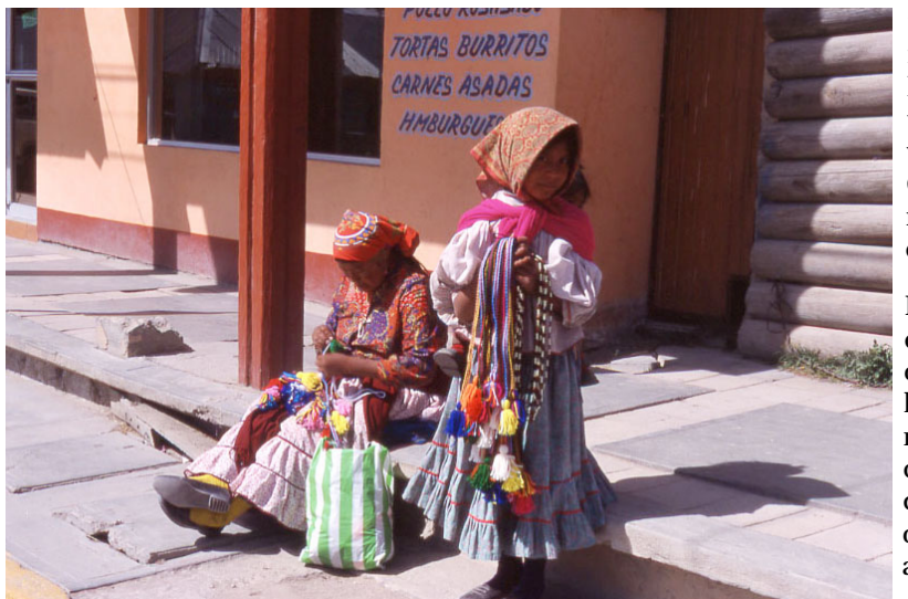
The town provides a base for a few days of geographic exploration. Students undertake their third field assignment, to evaluate the effects of tourism on this town. They map the

In spite of the new tourist industry developing in Creel, it remains the central place for the Rarámuri. These people inhabit a homeland second in size in North America only to the Navajo reservation in the U.S. Originally living to the east on the plains of the Mexican Central Plateau, they were pushed over centuries by Spanish expansion farther into the rugged Sierra. They maintain an isolated and often seminomadic existence, choosing tradition over assimilation. Creel is often the meeting point between outside, western tourists and these indigenous people.